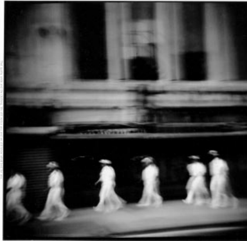
Daddy's so proud, daddy's so good. Sweet sweet daddy let it go. The magic man with big bear laugh and curf links. Set a sleeping bag, and so let it go. At least one person know, so let it go daddy.