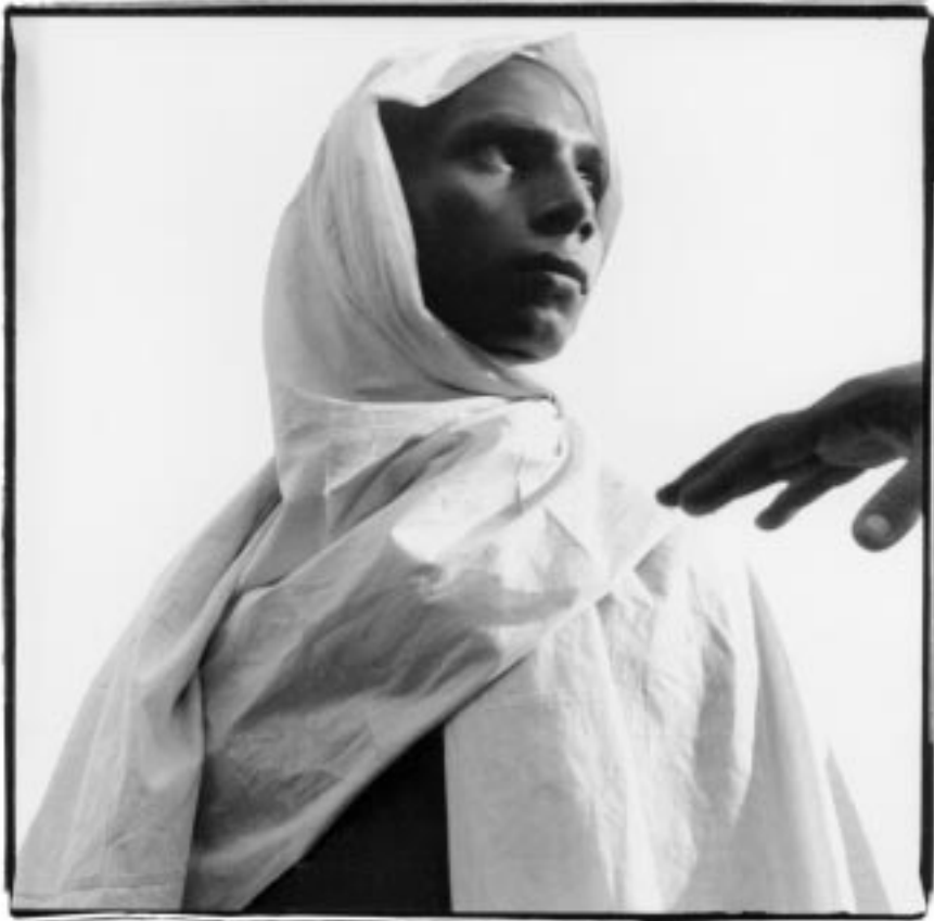
Fathering, fathering... It's the legacy, the history, the stories of what your father said, what he always said. Wait until your father gets home. Father, father... father up above.