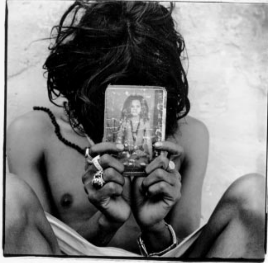
That quirky smile and the clothing. We still notice you and we still know what best for you.