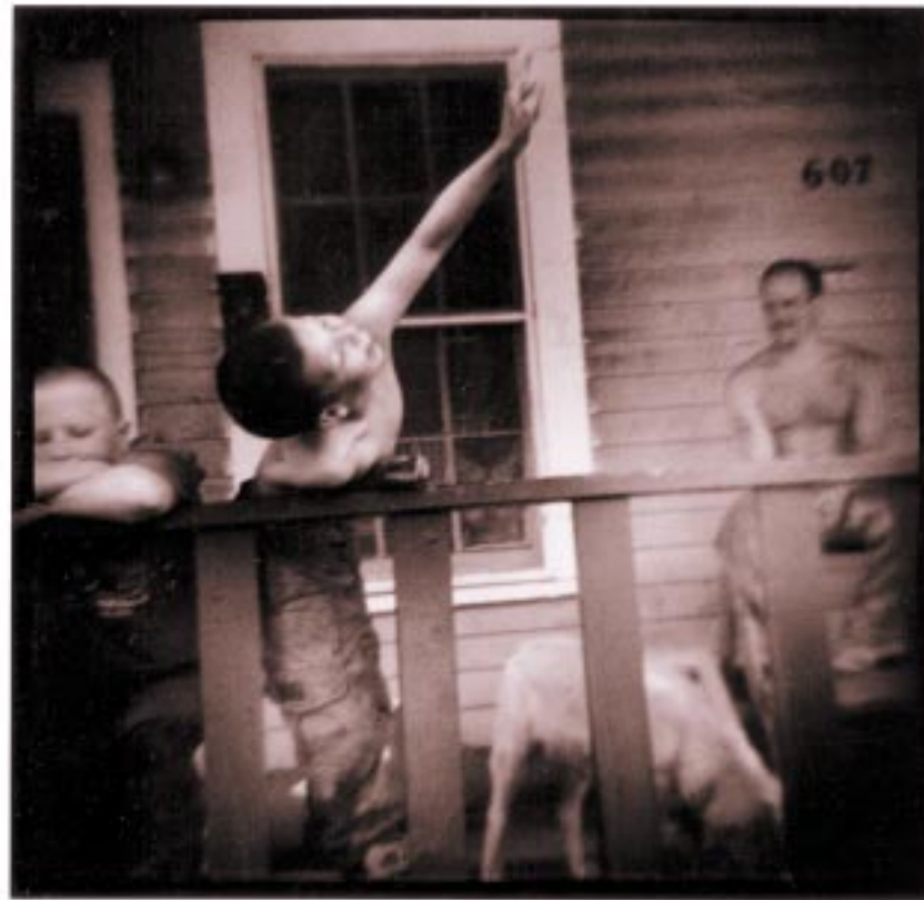
1.HEY SELF DEFEATER 2. HURRY, PLEASE HURRY 3. I WOKE UP IN THE MAYFLOWER 4. TEMPTED 5. IN THE AFTERNOON 6. JASON 7. CIAO MY SHINING STAR 8. APARTMENT MURDERS 9. BILL JOCKO 10. FATHERING

Sell it free and if it comes back... You can't take a chance on it. You need true love, you need it as of now and you need it forever. A deaf ear, a blind eye, yours or mine. At least one of us knows how that good it is. It's one sided, you know, a one sided seesaw.